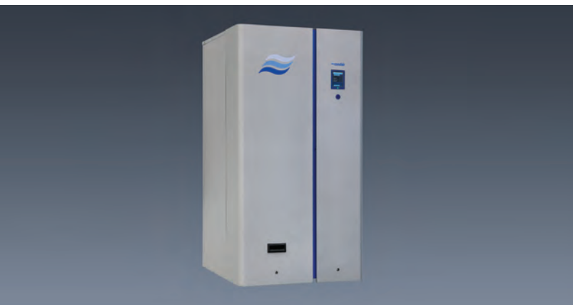
Gas-fired steam humidification