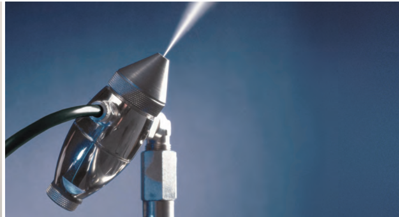
In-duct or direct air spray humidification