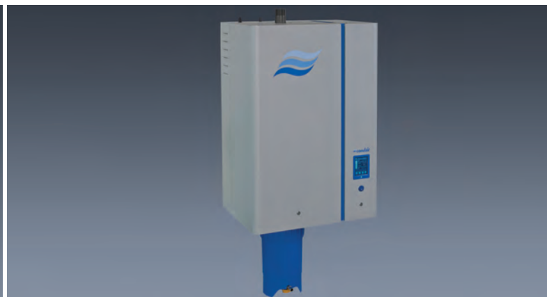
Electric steam humidification